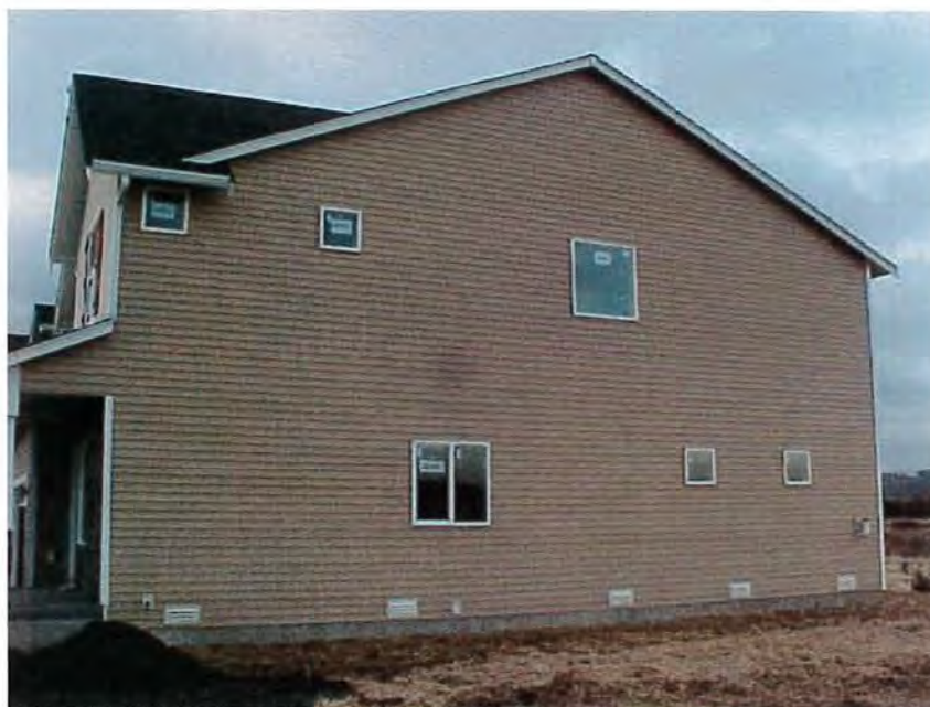
LOT 79 NORTH FACE 02-04-08