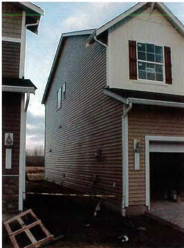
LOT 79 SOUTH FACE 02-04-08