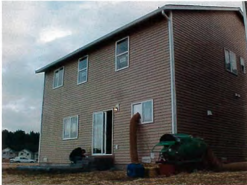
LOT 79 WEST FACE 02-04-08